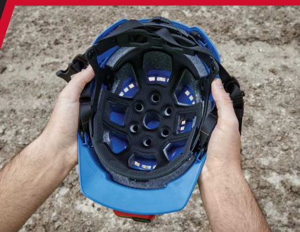
More Comfortable Suspension