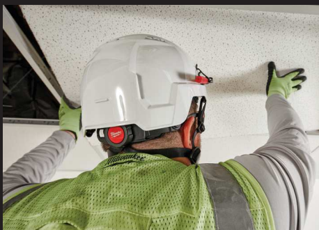
Protects Side and Top Impact

Meets Energy Absorption Capacity clauses 4.2.1.2 (Front), 4.2.1.3 (Side), & 4.2.1.4 (Rear), and Retention System clauses 4.2.3 (Strength) & 4.2.4 (Effectiveness) of EN12492:2012