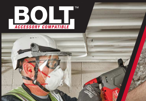
BOLT™ Accessories Compatible